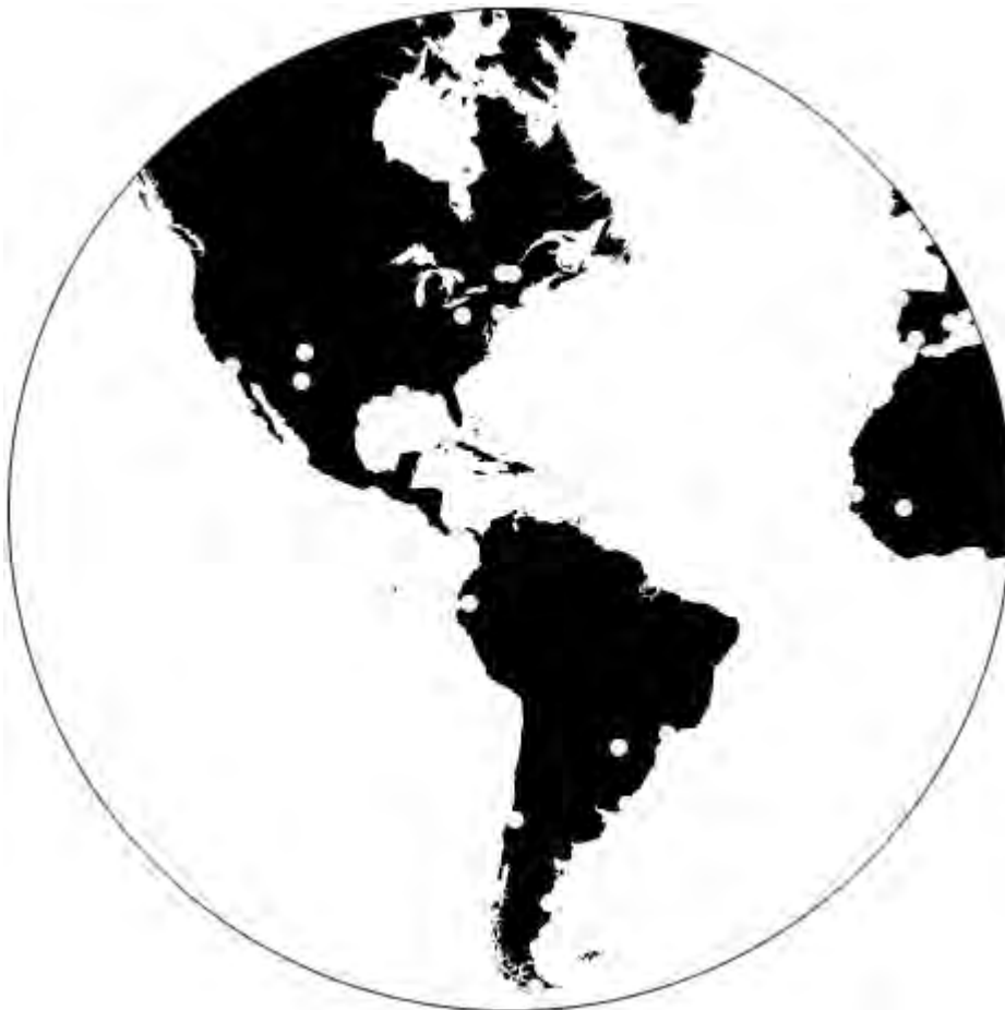
Distribution of biennials - map of America. The image above is a captures of a continuously updated map applet which can be found at the BF's Directory of Biennials page .

If the biennial began, in 1895, as an ideal form for internationalizing local art worlds(at least within the centres and peripheries of Europe), we could say that, now, it has become one among the many forms that are assisting to localise and regionalise the international. Like other changes in exhibition making, this is also a result of changes in art practice, which has for decades been leading curatorial practice. An example is the 2013–14 Carnegie International, which responded to this overall situation in a number of interesting ways. It introduced a range of local activities two years before the opening of the main exhibition. The curators also extended the exhibition into local playgrounds (Tezuka Architects), and supported such specific community initiatives as reviving the practice of local libraries checking out works of art as well as books (Tranformazium at the Carnegie Library, Braddock). In the museum-based aspects of the show, the work of artists concerned with questions of locality (Joel Sternfeld on utopian communes) was highlighted.[17]