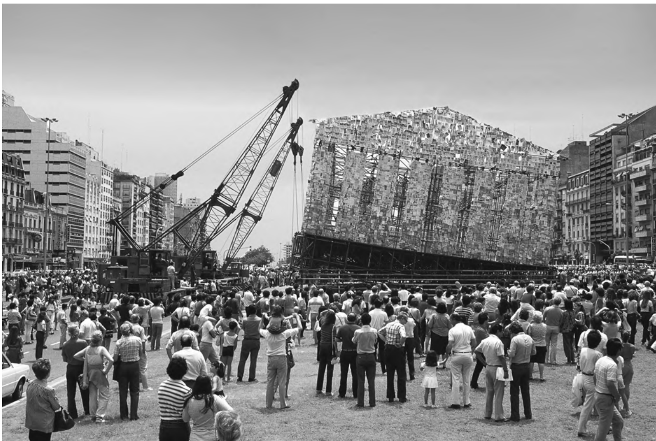
Marta Minujin, El Parthenon de libros ( Parthenon of Books), 1983. Installation, Avenida 9 de Julio, Buenos Aires.