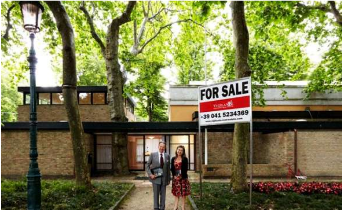
Photos of The Collectors , exhibition curated by Elmgreen & Dragset at the The Danish & Nordic Pavilions, 53rd International Art Exhibition - La Biennale di Venezia, 2009. Installation views.