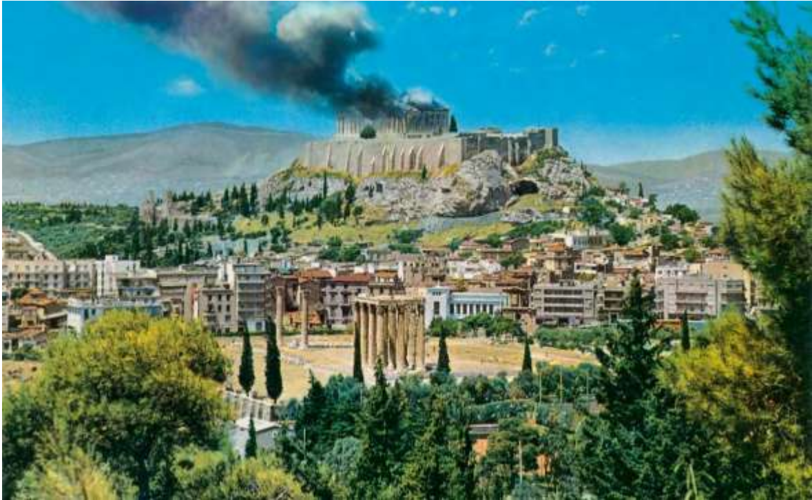
Yannis Karlopoulos, News from the Past Series, Athens: Acropolis view with Smoke, 2013. Collage, vintage postcards (First published in South as A state of Mind issue 5).