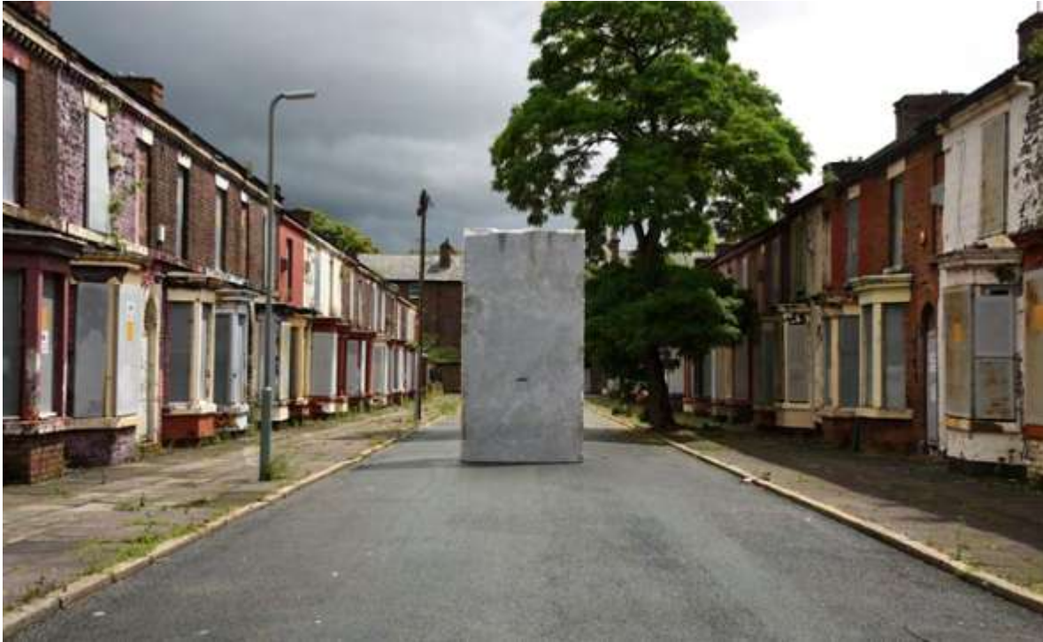
Lara Favaretto, Momentary Monument – The Stone , 2016. Installation view at Welsh Streets, Liverpool Biennial 2016.