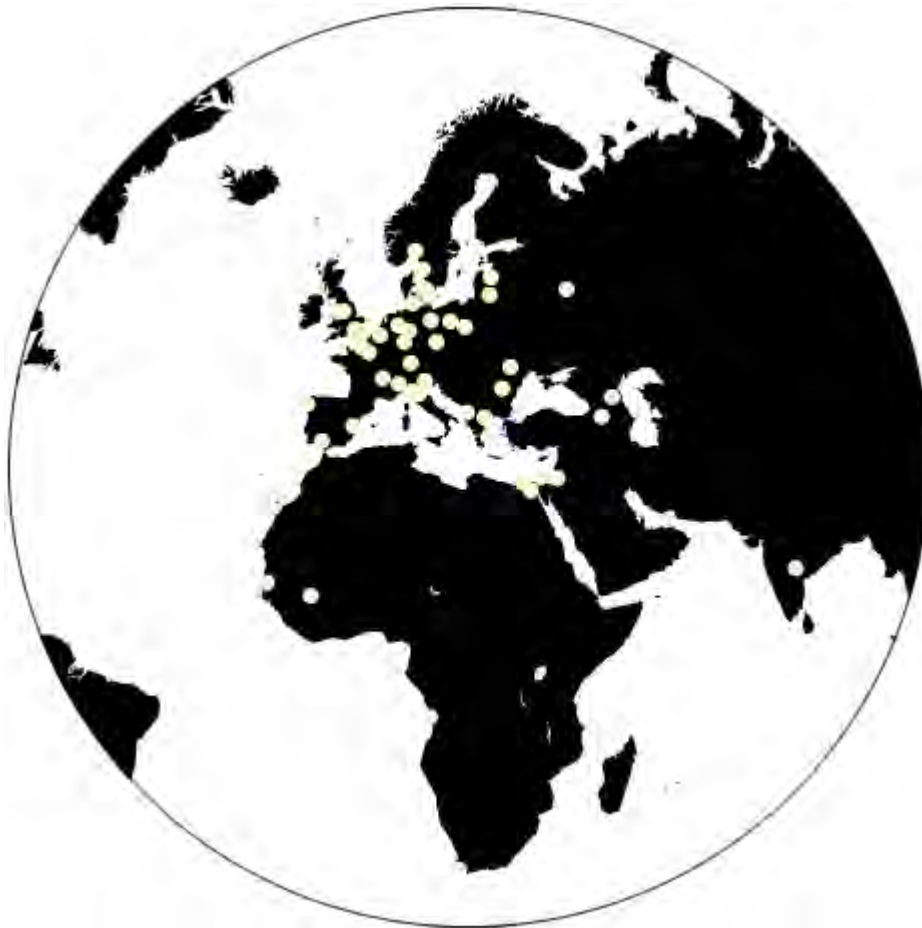
Distribution of biennials - map of Europe. The image above is a captures of a continuously updated map applet which can be found at the BF's Directory of Biennials page .