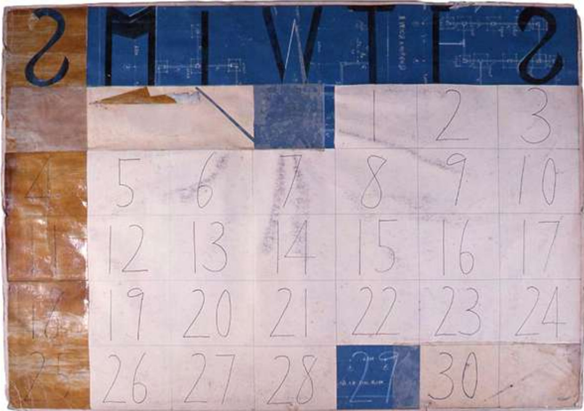
Atsuko Tanaka, Calendar , ca. 1954. Ink and pencil on paper, collage. Collection Ashiya City Museum of Art & History. © Kanayama Akira and Tanaka Atsuko Association.

A sort of animation mechanism is indicated here, whereby the calendar's virtual plasticity becomes a translation tool. It opens up a lexicon of 'forms' and sensitises us to the calendar as an encounter of difference, plurality and adaptability within its environment.