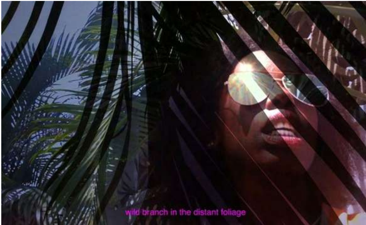
Julien Creuzet, LOVA LOVA, SAFARI GO, 2016. Video still, 9'17".

My interest in the notion of mobility began in 2008 when I was working on an experimental programme for disadvantaged youth at the SNCF Foundation (a charitable body set up by the French railway company). The project, entitled Transeuropéen , invited schools to travel to different European capitals for a period of three weeks. The pedagogical aspects focused on the preparation of the journey during classes held over several months. The aim was to promote another vision of European mobility and citizenship and to conclude with an artistic project.