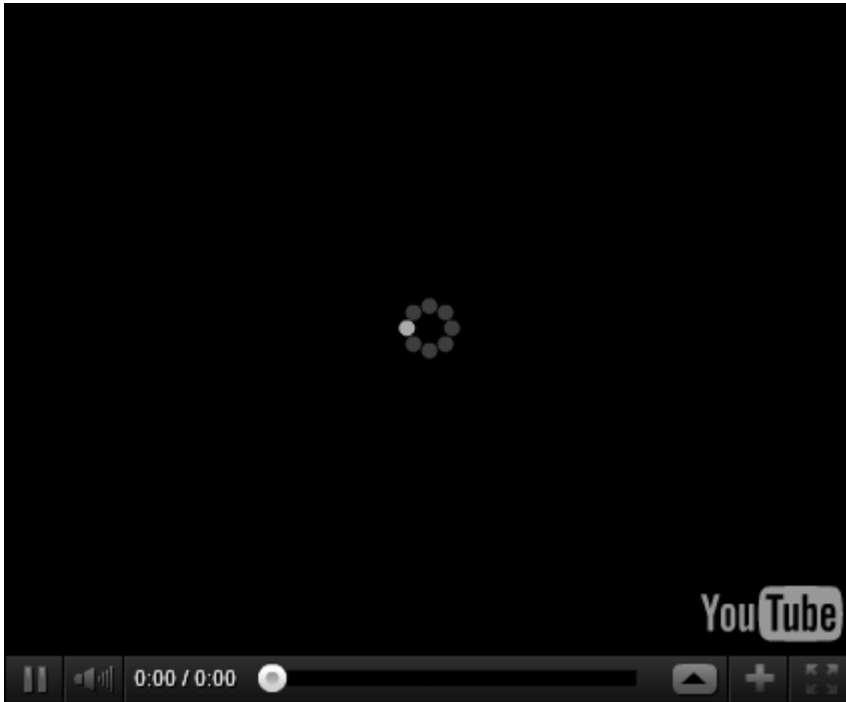
Buffering, screen grab, online source.

It is the machine that is now crucial in producing our experience of real-time. We include these considerations because the experience of real-time (not to mention the way in which the notion has entered our everyday language) and thus of co-presence through computational technologies – or rather pseudo-co-presence – is a decisive factor in the coming into being of contemporaneity. And this testifies to a change in our experience of time itself.