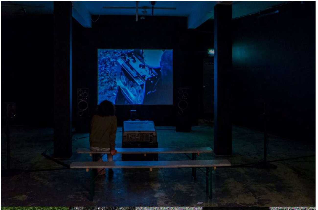
Mark Leckey, Dream English Kid, 1964 – 1999 AD, 2015. Installation view at Blade Factory.

Through time-stamping it may be possible to discover recordings of events that have taken place but of which you have no evidence. This is the case for Mark Leckey whose video work Dream English Kid 1964–1999 AD was also part of the Liverpool Biennial. He explains that when he found a recording of a particular Joy Division concert that he attended as a fifteen-year-old, he began to think, or fantasise, that ‘through audiosoftware [he] might be able to find [himself] in the recording. I was watching youTube and thinking FUCK. If that’s online, then maybe everything is now online and I can find everything that I remember.’[50]