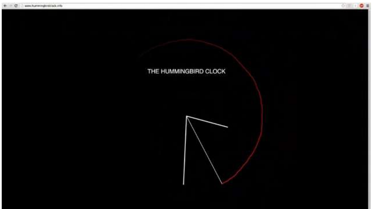
Lawrence Abu Hamdan, Hummingbird Clock , 2016. Film still, Liverpool Biennial 2016.

Timestamps are used as evidence that testifies to the exact sequence or simultaneity of events. In a work that was on view in Liverpool as part of the Biennial, artist Lawrence Abu Hamdan adopted techniques usually used for forensic evidence in criminal cases. His work Hummingbird Clock was located physically outside the law courts in Derby Square, and online at www.hummingbirdclock.info . Designed as a tool for investigations into civil and human rights violations, the clock records the second-by-second variations of the buzz made by the electrical grid. The sound files are made available online, so that the public can analyse the date and time of any recording made within earshot of the grid, in case they need to know whether the recording has been tampered with. The humming collected and presented is a timestamp in itself, and every digital audio recording from the area can be identified on a timeline through comparison with this hum.