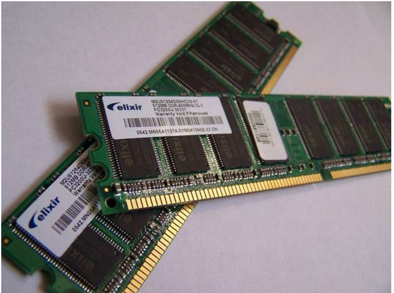
Example of writable volatile random-access memory.

Random Access Memory is a type of computer memory that can be accessed randomly. This means that any byte can be accessed without touching the preceding bytes.