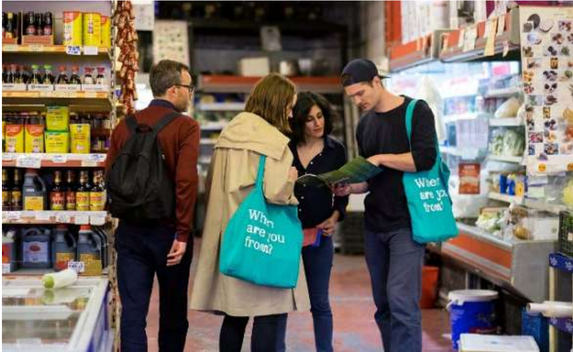
When are you from? Hondo Chinese Supermarket, Liverpool Biennial 2016.