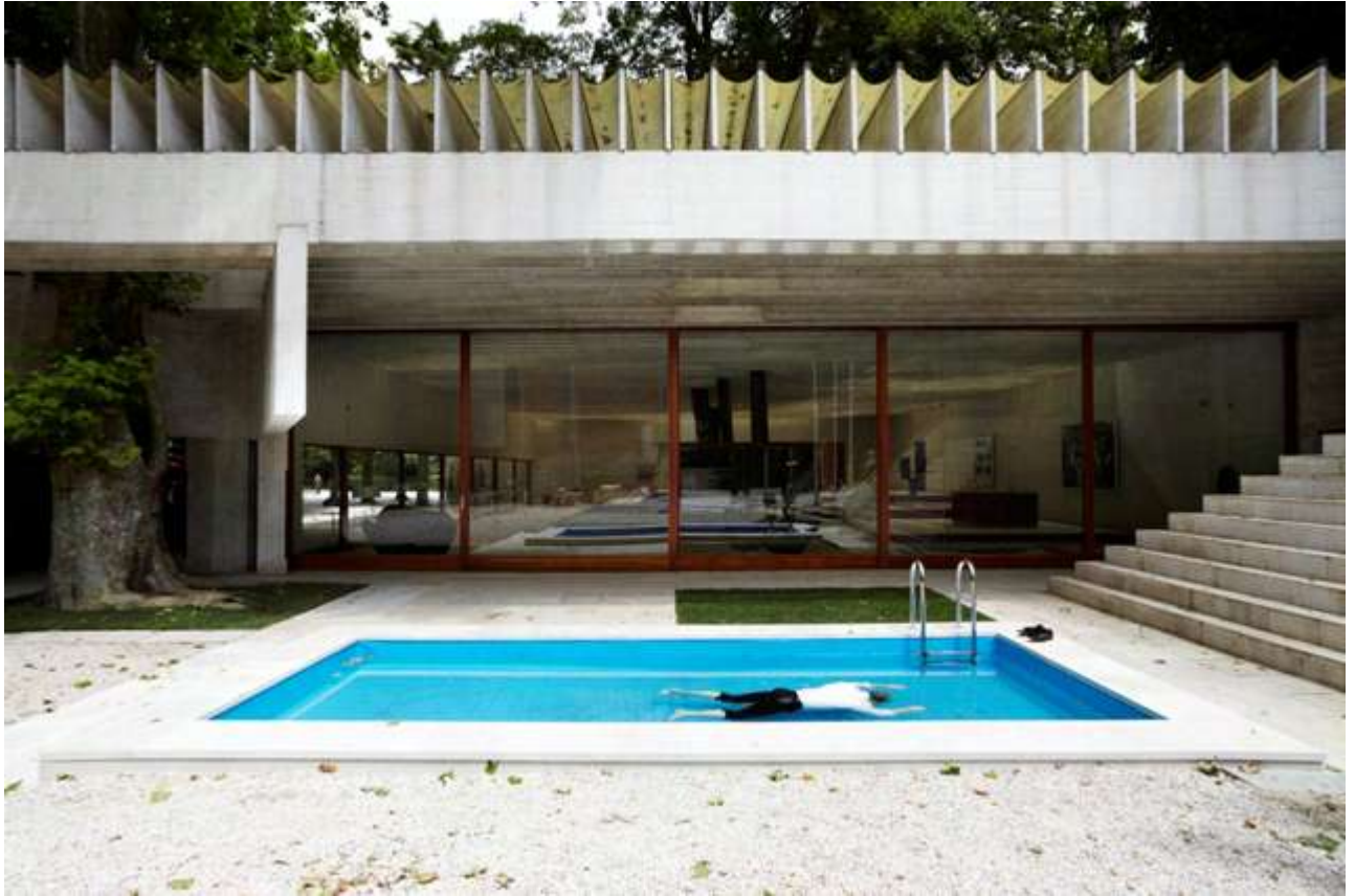
Death of a Collector