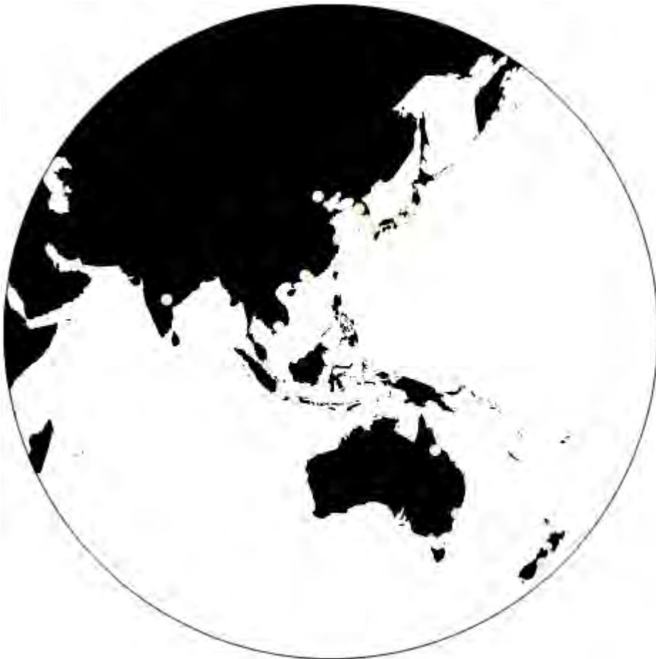
Distribution of biennials - map of Asia. The image above is a captures of a continuously updated map applet which can be found at the BF's Directory of Biennials page .

Eighth Climate (What Does Art Do?) , it opened with a recreation of the bookshop at which the uprising of 18 May 1980 was fermented, and which was greeted with the massacre of over 600 protestors by the military government. Reference to that uprising is a requirement of every edition of the Biennale. The exhibition continued through a suite of spaces that, according to reports of some sceptical visitors, judiciously mixed works that directly addressed current political concerns with those that invited quiet contemplation of abstract ideals. She also invited representatives of 70 small to mid-scale non-profit arts organizations from around the world to a workshop entitled To All The Contributing Factors .