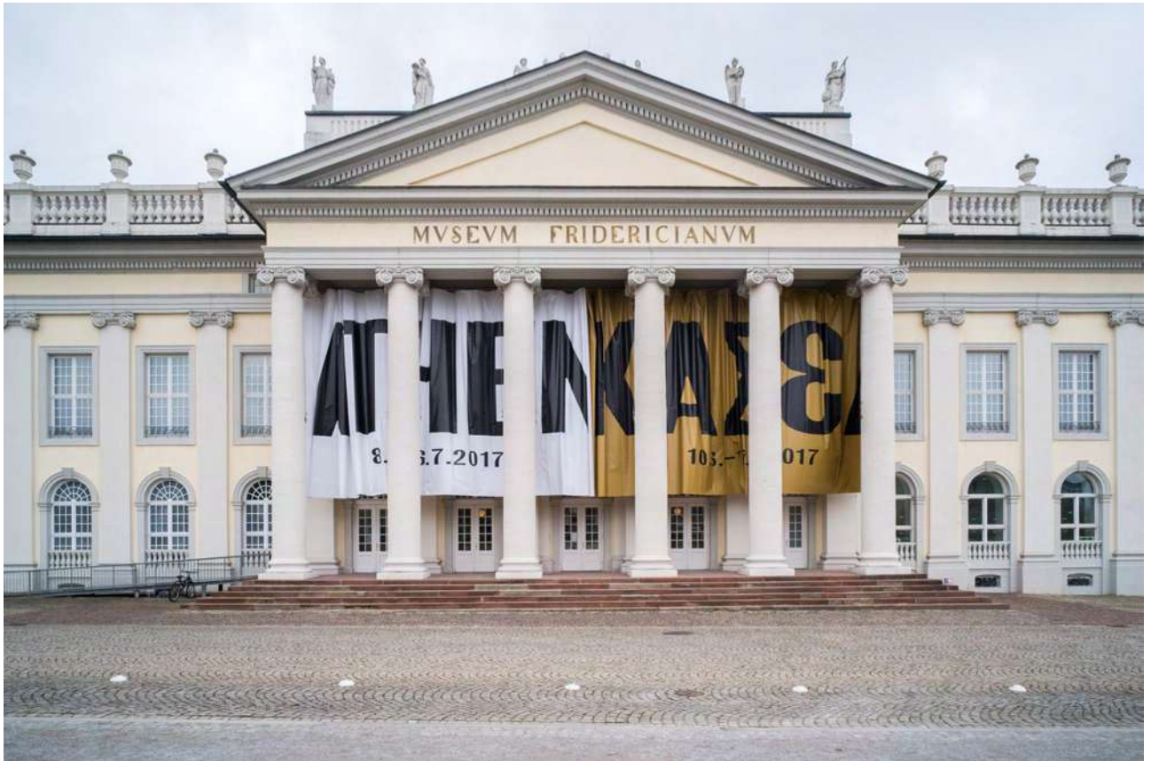
Fridericianum, Kassel.

of shifting into the questions asked and the pursuit for answers might be more helpful.