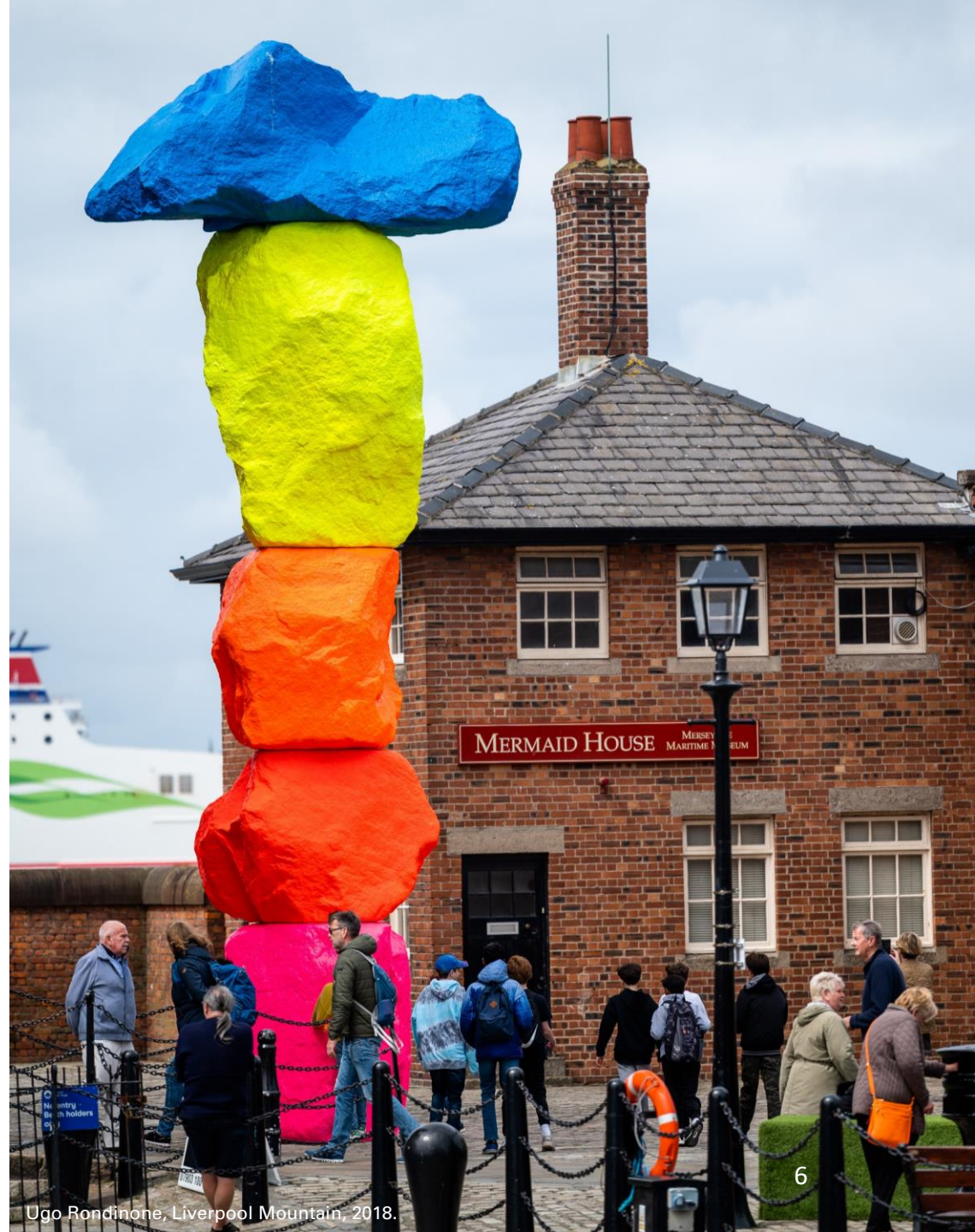
Ugo Rondinone, Liverpool Mountain, 2018.

Over the past 3 years the team and Board have been thinking about the kind of organisation we want to be and how we best serve our audiences, artists, communities and team. Our aim is to think about the intention and impact of all our work, aiming to create A Biennial for Everybody, that breaks down barriers to experiencing art. We know that to thrive in the complex and volatile conditions within which we are working that we need to listen, reflect and change how we operate, acknowledging our connected role within local, national and international ecosystems and contributing positively to the world in which we operate.